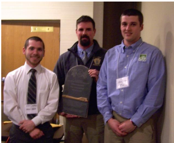
College Quiz Bowl Winners! Penn State University Park