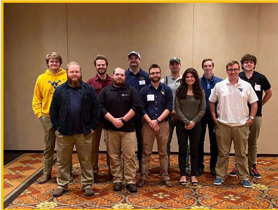
Eleven students from the WVU Chapter of SAF attended the meeting