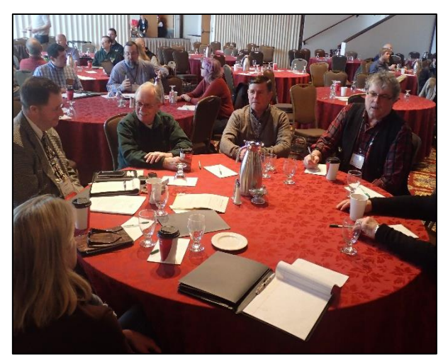
The SAF New Jersey Division discusses business Friday morning.