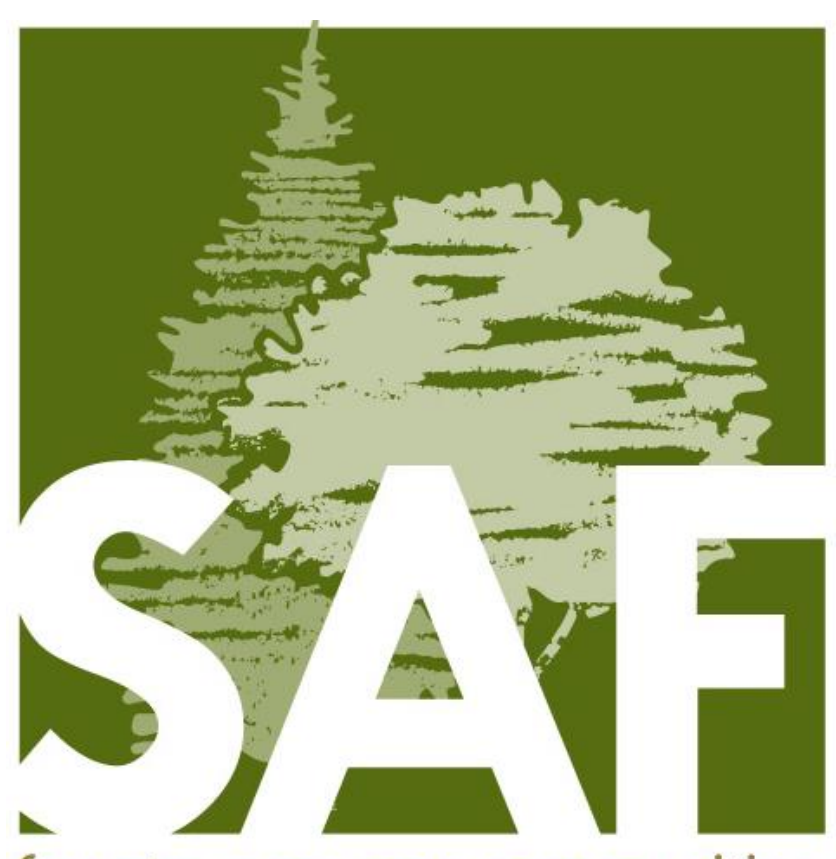
forests, resources, communities,

Allegheny Society of American Foresters Spring 2020